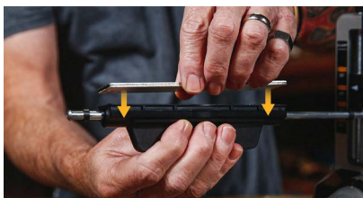
7 Premium abrasive grit panels included