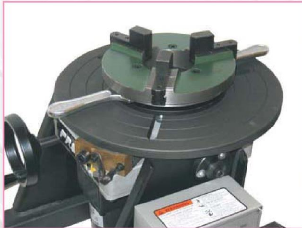
Welding Positioner Chuck mounted onto the WP250-2 Positioner