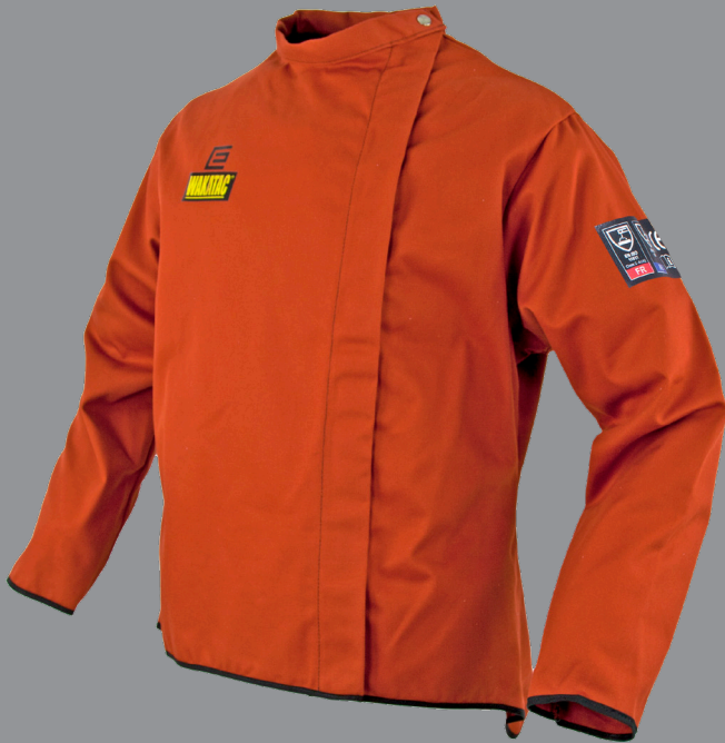
WAKPJ30 WAKATAC® JACKET