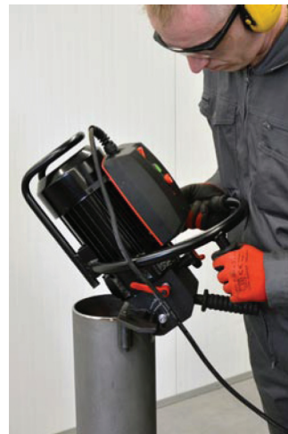
Pipe bevelling 260 - 600mm (option)