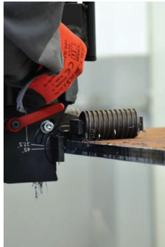
0° Edge planing attachment (option)