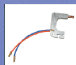
Part No: CAwheelarch (Standard)