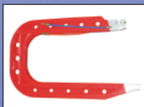
Part No: CA600wc (Optional)