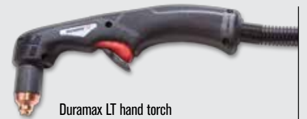
Duramax LT hand torch