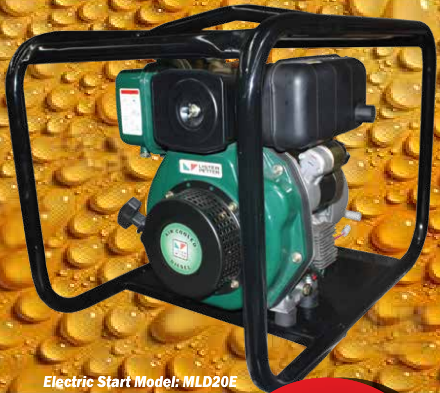
Electric Start Model: MLD20E