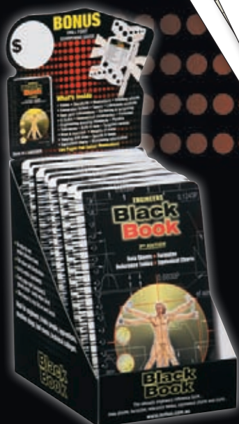
Merchandise (books sold separately)

A wealth of up-to-date, useful, information within over 160 matt laminated grease proof pages. Wire bound to stay flat on workbench when reading and is ideal for engineers, trades people, apprentices, machine shops, tool rooms, technical colleges.