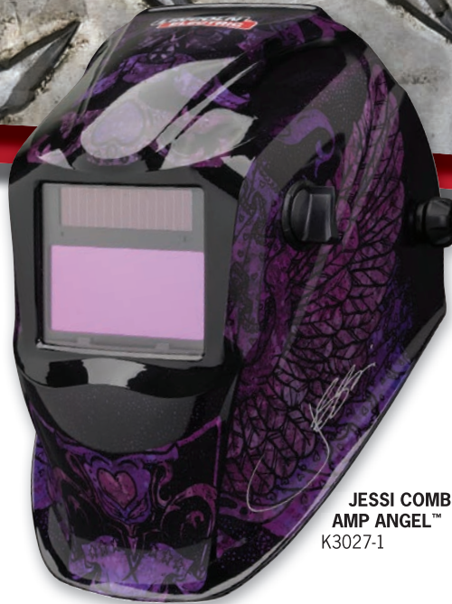
JESSI COMBS AMP ANGEL™ K3027-1