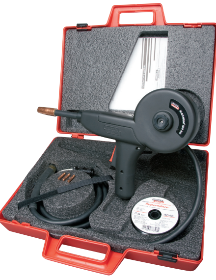
Complete Kit. No Bulky Module Required. Order K2532-1