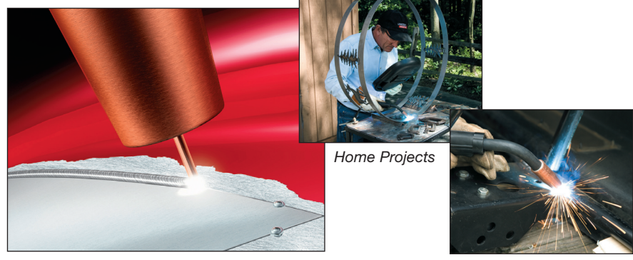
Thin Sheet Metal Autobody Work