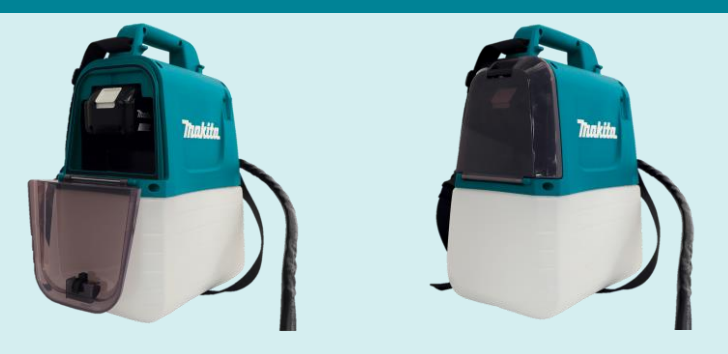
Covered battery compartment to minimize any water getting in