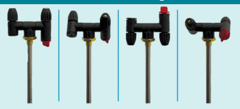
Rotatable Dual Head Nozzle Design for efficient coverage