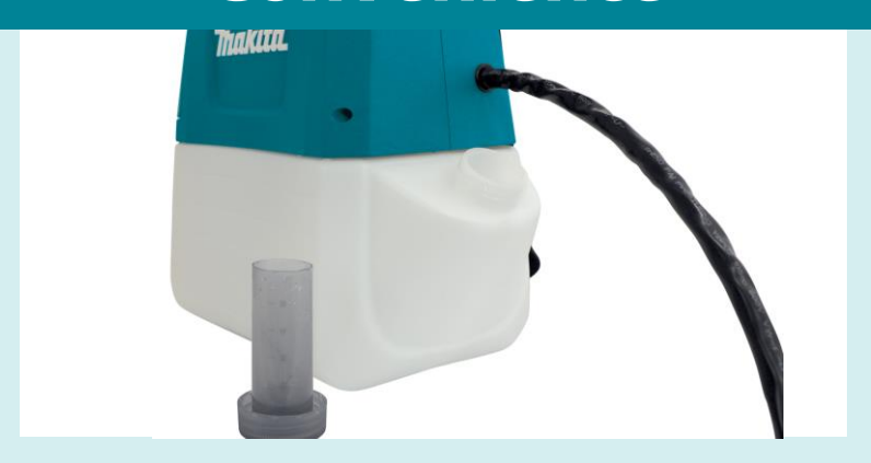
Easy fill tank with measuring cup inside cap