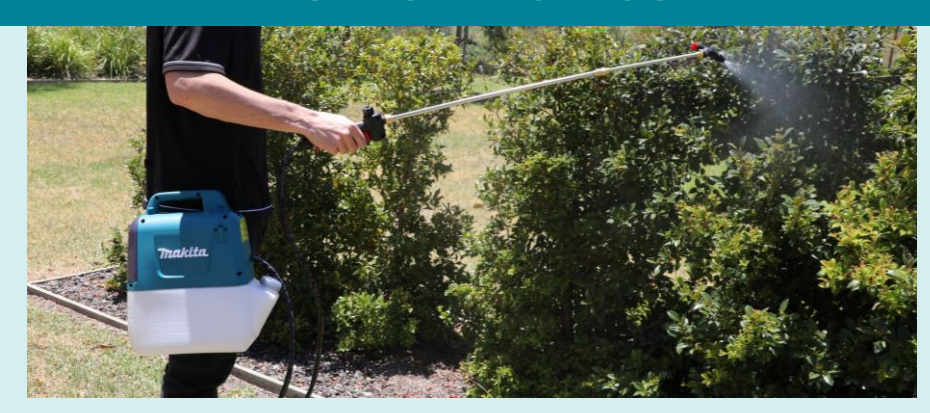
Maximum Permissible Pressure: 0.3MPa