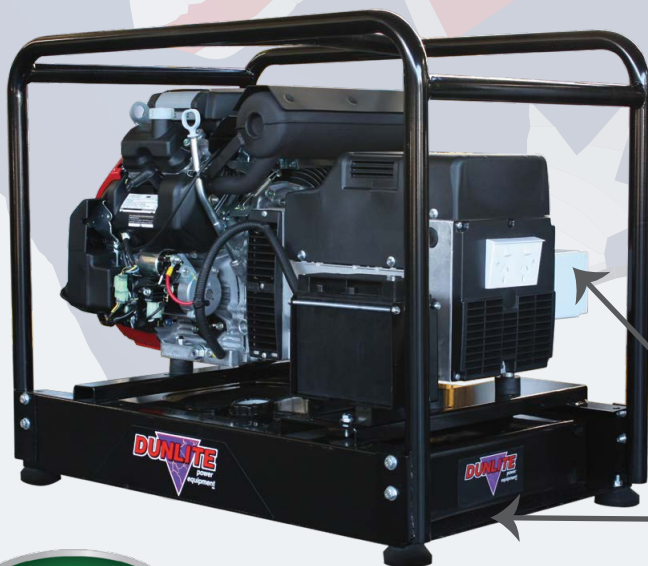
12kVA Honda Generator Model: DGUH11E-3S-2