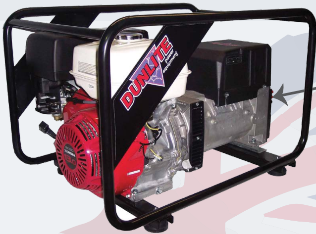
7 kVA Honda Generator* Model: DGUH6.5-3S-2