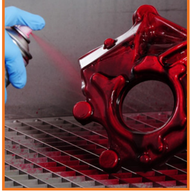
Locating critical defects with Red Dye Penetrant