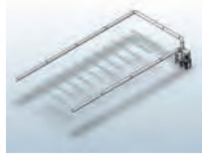
U-shaped push/pull-system with 1 filter unit and 1 fan.

Some examples of push/pull-systems incorporating Lincoln's SCS filter units and the FAN 120 fans are given below: