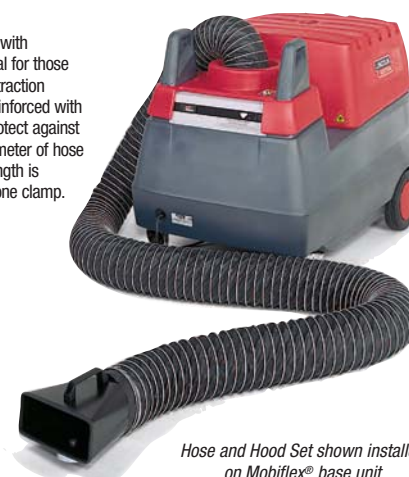
Hose and Hood Set shown installed on Mobiflex® base unit