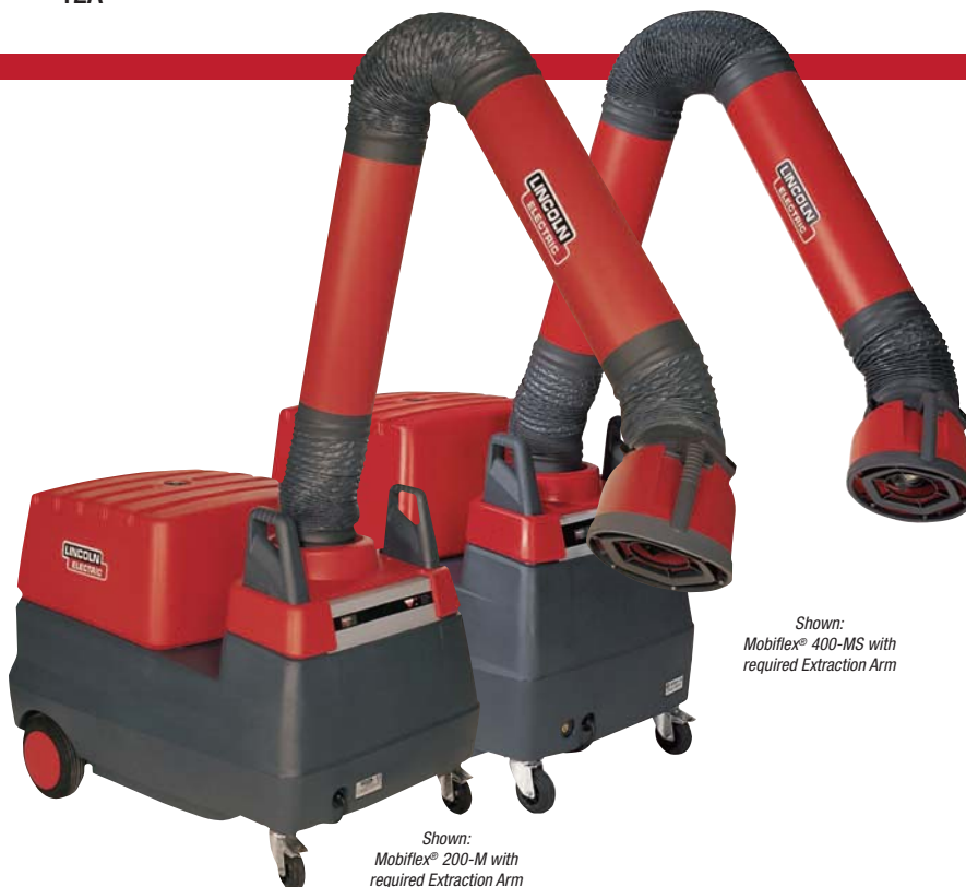
Shown: Mobiflex® 400-MS with required Extraction Arm