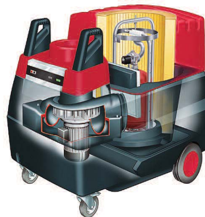
Internal view of Mobiflex® 400-MS showing RotaPulse® self-cleaning filter mechanism.