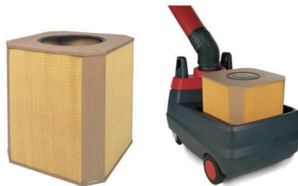
Mobiflex® 200-M Filter