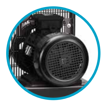
Efficient motors High-efficiency, MEPS-compliant IP55 motor.