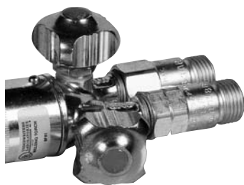
Shown attached to a handle